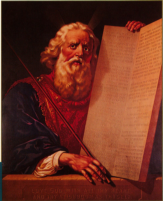
An artist's impression of Moses holding God's rules that He wrote on two stone tablets

An important Jewish celebration is Yom Kippur . It is in September or October each year. Jews do not eat on this day. They feel regretful about past deeds that go against God's law, their sins. If they truly repent, God forgives their sins.