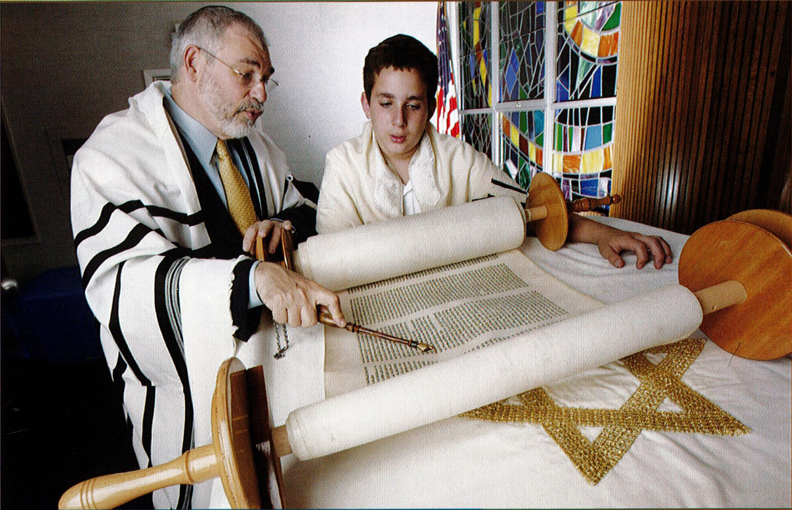
A rabbi discussing the Torah with a Jewish boy