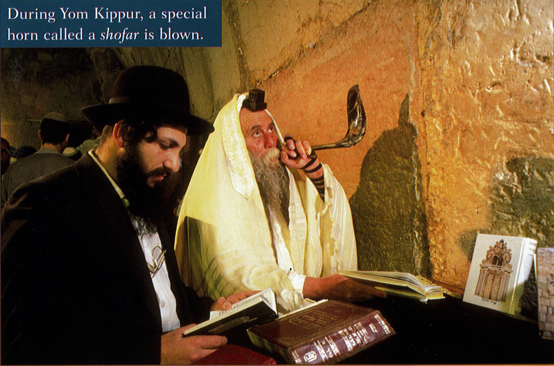
During Yom Kippur, a special horn called a shofar is blown.